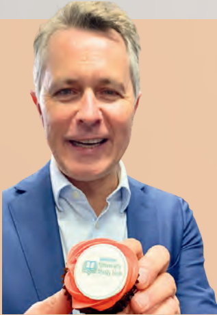
Hon. Jason Clare

13th November - We've opened with a bang!